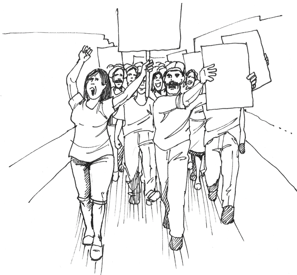
Members of the Workers' Union and community allies demonstrate outside of an event where the Wage and Hour office is speaking.